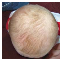
After STARband™ Treatment

For more information, visit www.starbandkids.com or contact: