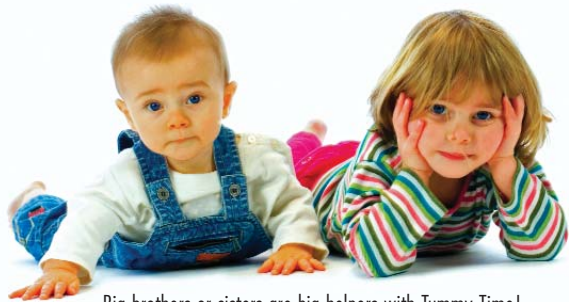
Big brothers or sisters are big helpers with Tummy Time!

For more information, visit www.starbandkids.com