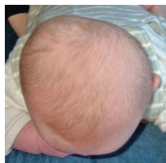
Before STARband™ Treatment